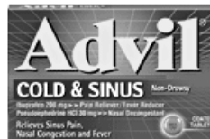
Advil Sinus Ibuprofen / Pseudoephedrine