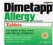
Dimetapp Allergy Brompheniramine