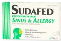
Sudafed Allergy Chlorpheniramine